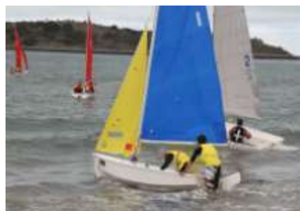
Heading out to race