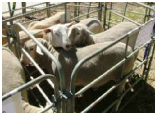
The 1 st place pen of sheep