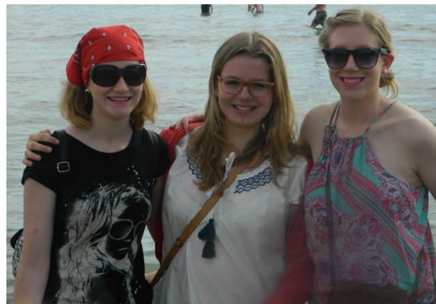
My two host sisters and me