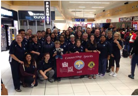
The Connecting Spirits Group 2015!!