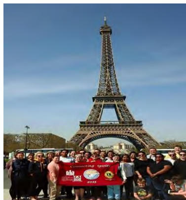
At the Eiffel Tower