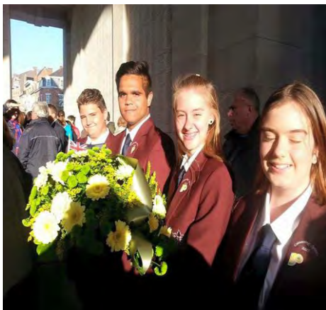
Ready to lay the wreath at Menin Gate