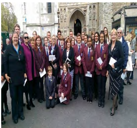
At Westminster Abbey