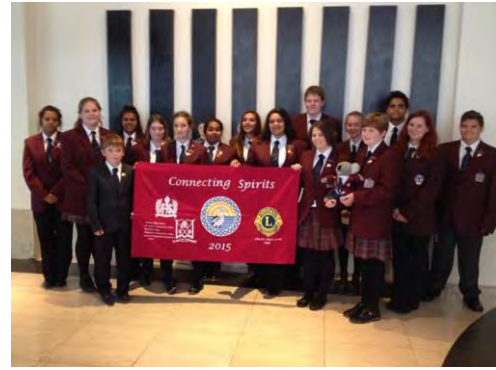
The Group on Anzac Day