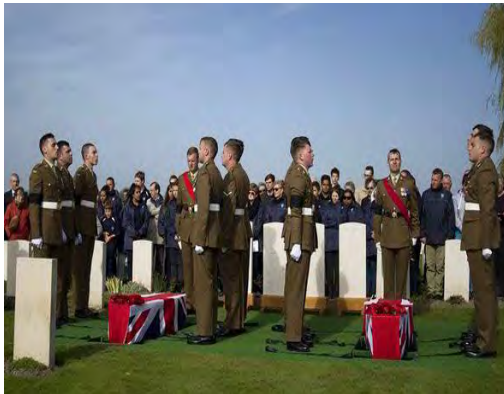
At the reburial of the 6 unknown British soldiers