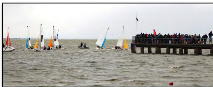
Spectators at Meningie north jetty watching the event

Sailors interchange crews at the recent championships at Meningie