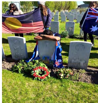
A picture speaks a thousand words