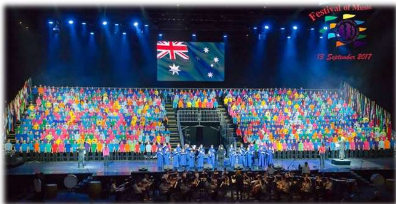
Public Primary Schools Festival of Music 2017